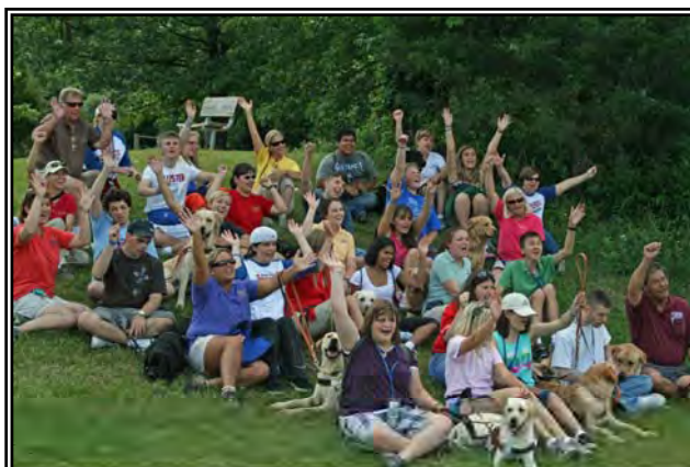
Leader Dogs 2011 Kids Camp Pictured here are the young folks and their guide dogs who attended the Leader Dogs summer program. Prior to receiving their dog, each client attends a 26-day residential training program to be paired with a guide dog. This is a life-changing event that opens the door to independence, safety and self-worth for many of the students.

Each year, over 270 students attend a 26-day residential training program to be paired with a guide dog. This is a life-changing event that opens the door to independence, safety and self-worth for many of students.