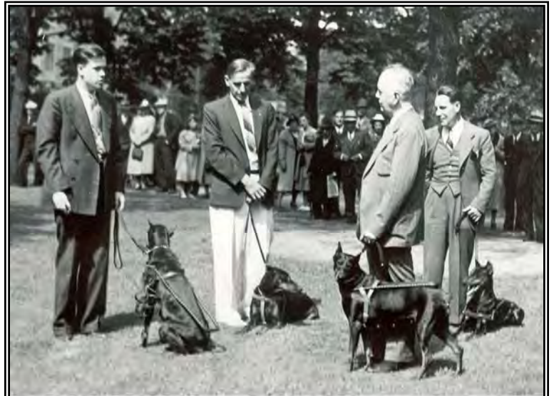
Leader Dogs for the Blind first graduating class in 1938. See articles and additional pictures beginning on page 3.